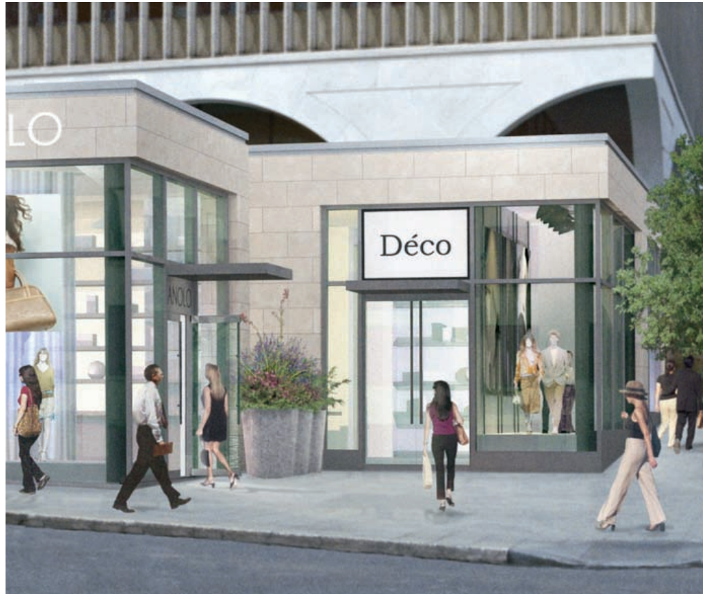
Virtual image of building concept as viewed from Fifth Avenue & University Street, looking south.